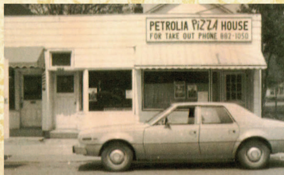
Petrolia Pizza House - building razed.