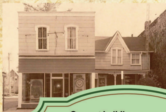
Union Gas Office and Scarsbrook - buildings razed.